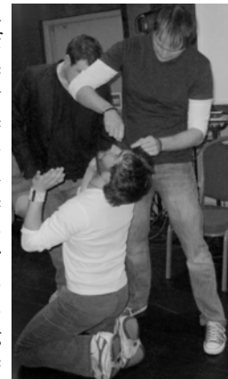
Kill the Monster performing some ghastly operation

friends broke into a pet shop in search of a replacement on the principle that "Any rodent will do". The outcome was a "Hip-hop hamster called Harry". The whole show became hilarious with much laughter from the audience as the team joined forces in the Operating theatre to address the "broken leg". This was an adventure of rollicking, flowing comedy of improvisation that evoked peals of laughter and too much anaesthetic. This Mad, quirky, gyrating bombshell did really "Kill the Monster"