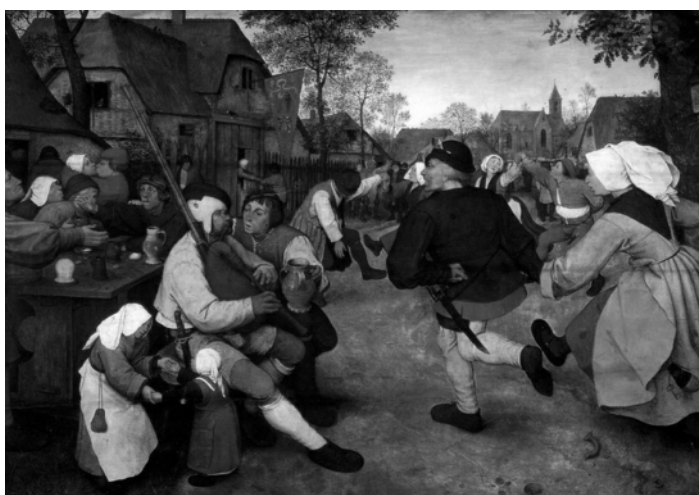
The Kermess by Pieter Breugal the Elder 1567