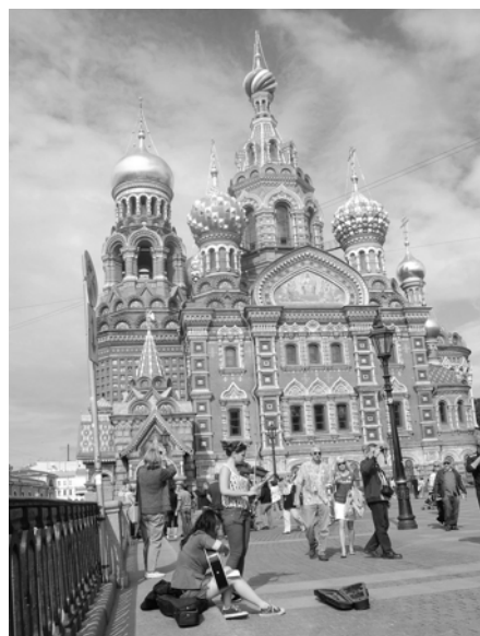
The Cathedral on Spilled Blood

What a name that is, the Cathedral on Spilled Blood. A quintessentially eastern building in a neoclassical city, it was built as a shrine to the reforming Tsar, Alexander II, assassinated on this spot by a terrorist bomb. Alexander III was, not surprisingly, less keen on reform. The Russian style of the church was a reassertion of traditional values, its swirling golden domes rising above an exuberant confection clad in mosaics. The interior is no less impressive, covered in mosaics on religious and historic themes, pervasively blue, almost a calming influence on the hordes of visitors.